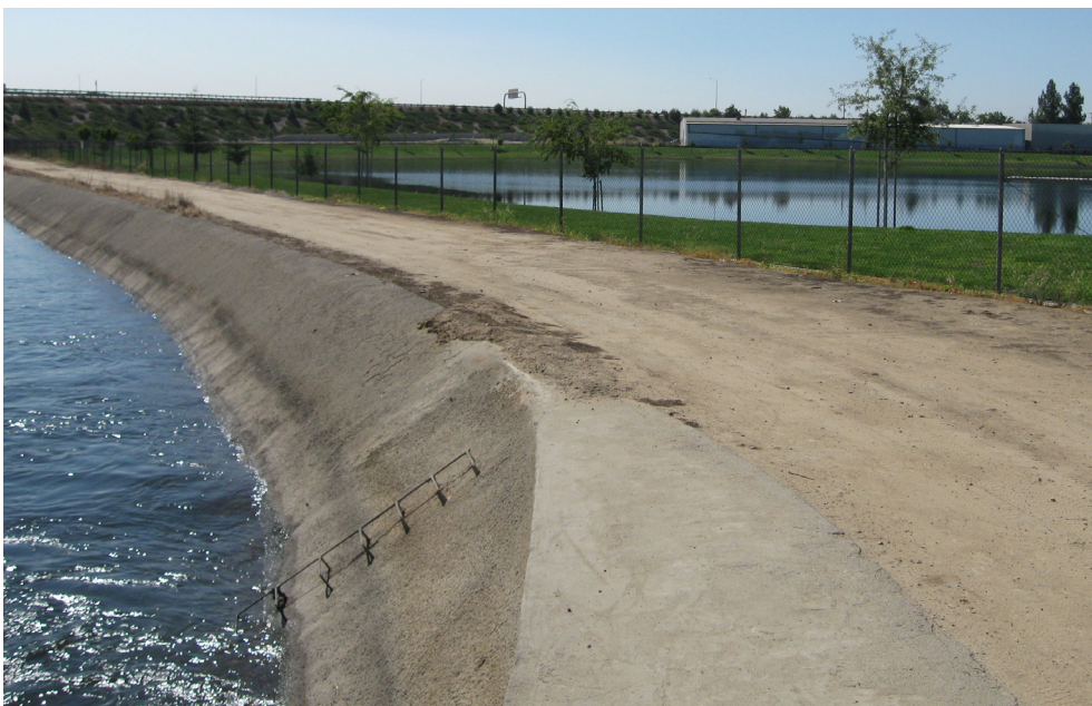
Neighboring infrastructure - A Fresno Irrigation District canal adjacent to and connected via pipeline to an FMFCD stormwater basin (Nielsen & Teilman, in southwest Fresno)

“Today there are more than twice the number of urban stormwater basins...ready to accept and recharge...surface water”