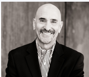
Guest writer: Bruce Bender, Risk Communication and Outreach Consultant, Bender Consulting Services, Inc.

For more than 50 years, how FEMA determined the cost of an NFIP policy never changed much. It was centered on two main factors, which were based on a community's flood map. First, what flood zone was the building in. And second, how high was it above the predicted floodwaters (known as Base Flood Elevation, or BFE 1 ). If it was in a high-risk flood zone (e.g., Zone AE, VE), an Elevation Certificate (EC) was needed to provide a quote. If an EC didn't already exist, the property owner would have to hire a surveyor. This resulted in a costly, time-consuming path for a property owner to buy a policy.